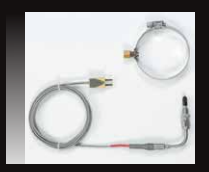
Industrial Grade Thermocouple